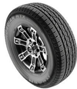
ROADIAN HTX RH5